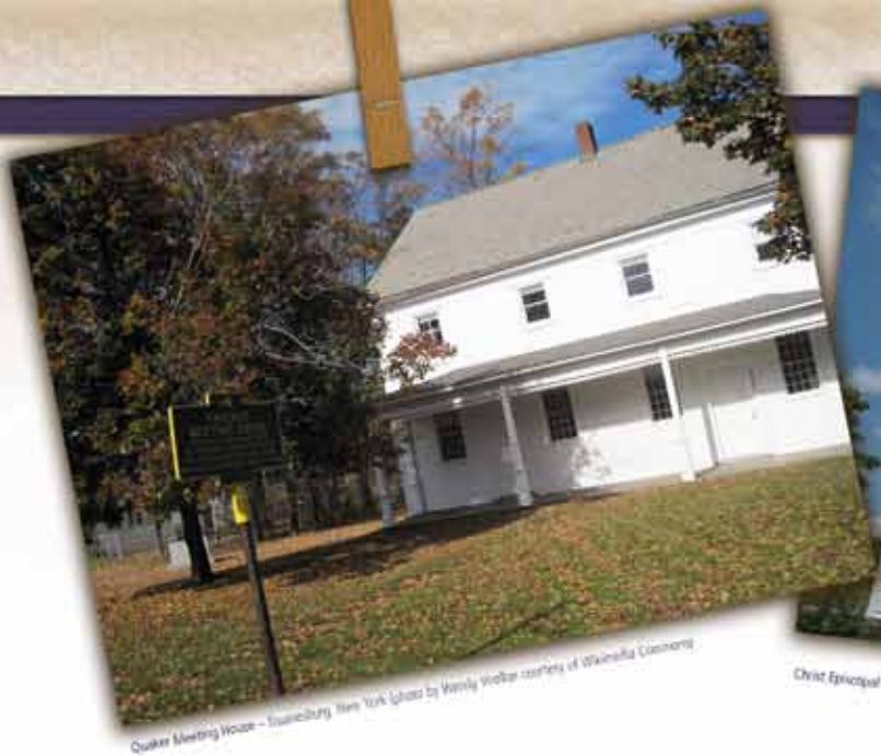
Quaker Meeting House - Duaneburg, New York